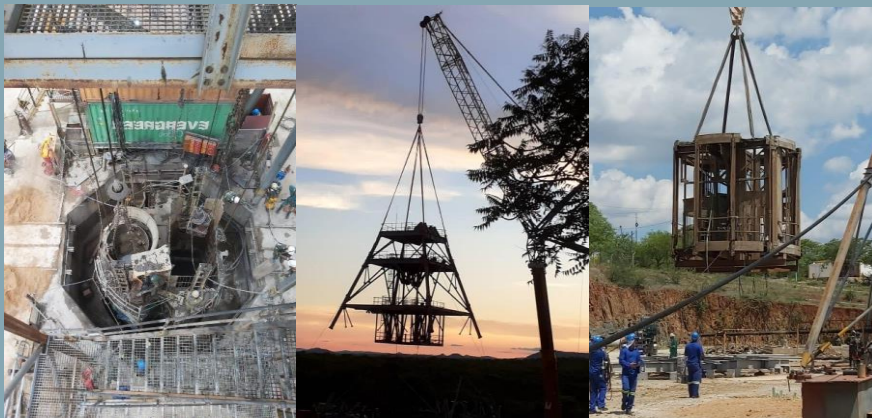
Equipping at Central Shaft

Operationally the last six months have been transformational for the business. Central Shaft has been a five-year project costing $63 million, all funded through internal cash flow and I am delighted that the sinking and equipping stages have been completed and commissioning is on track to be completed in the first quarter of this year.