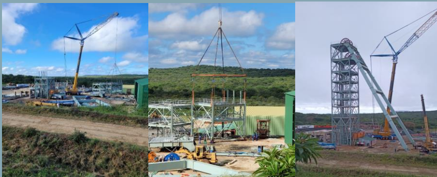
Commissioning at Central Shaft